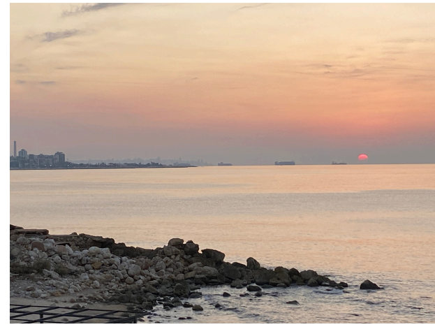
Christmas Day at the beach

I want to thank all of you that gave towards Balassan at the end of the year as part of your normal giving, or as part of the matching gift. We ended well and this puts us in a solid position for this year. Your generosity never ceases to amaze me! Thank you!