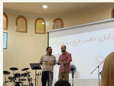
My brother preaching a sermon at my church during his visit!