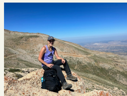
I finally was able to climb Mt. Hermon which has been on my "bucket list" for a while! (Psalm 133)